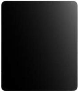
FLOOR PLATE SQUARE