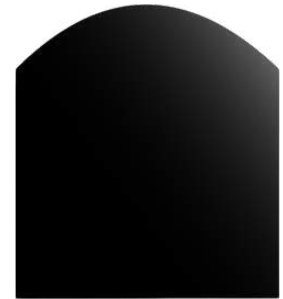
FLOOR PLATE OVAL